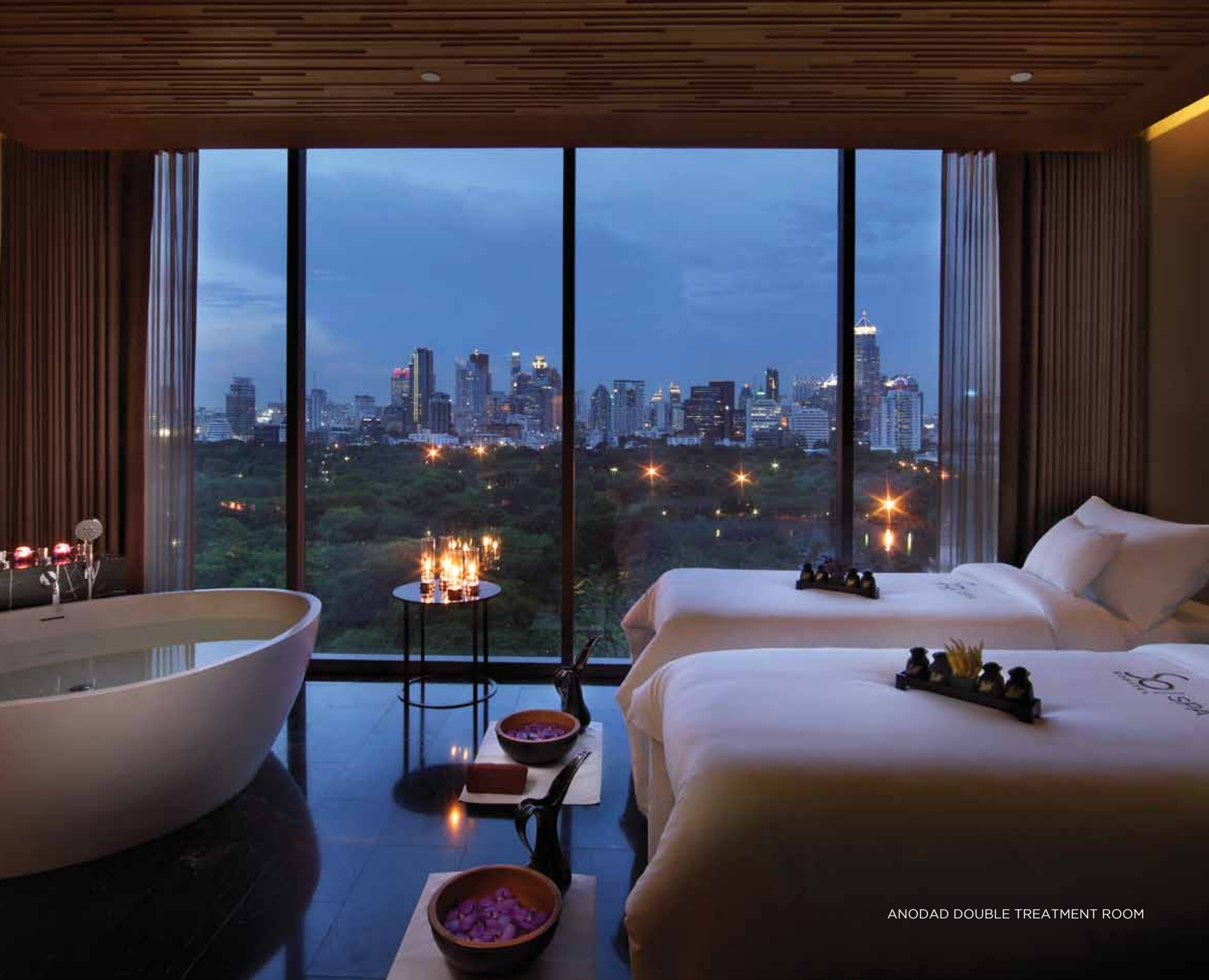
ANODAD DOUBLE TREATMENT ROOM