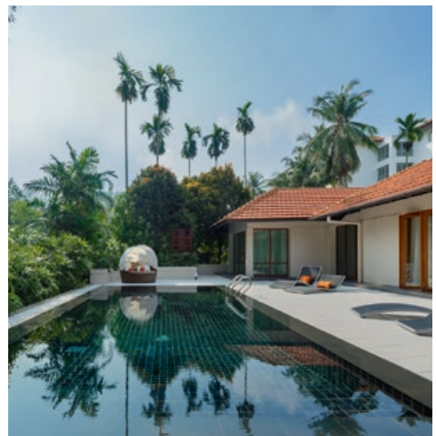
Private Pool at the Villa

For a comprehensive tour of Singapore's history and heritage, visit the National Gallery Singapore, National Museum of Singapore, Asian Civilisation Museum and more!