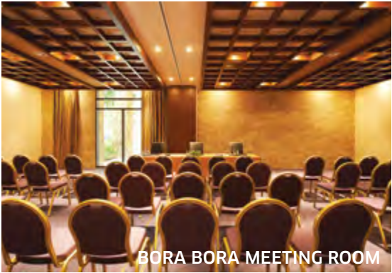
BORA BORA MEETING ROOM