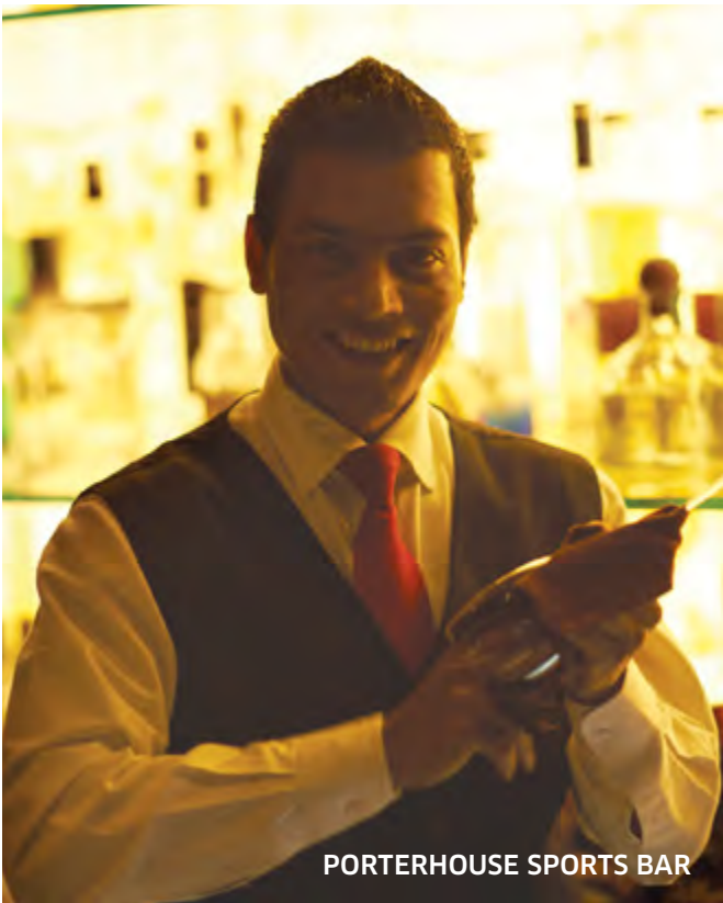
PORTERHOUSE SPORTS BAR