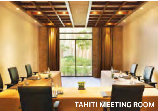
TAHITI MEETING ROOM