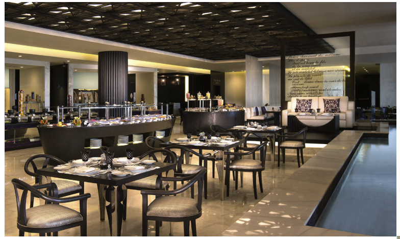
Corniche All Day Dining

DISCOVER THIS STUNNING ADDRESS, BLENDING ART AND FRENCH FLAIR SITUATED IN THE HEART OF THE VIBRANT CITY OF ABU DHABI.