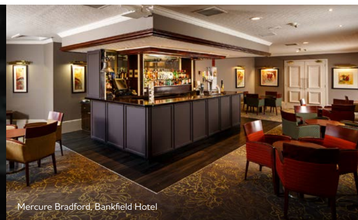
Mercure Bradford, Bankfield Hotel

Our commitment to quality means we take care of every detail for your meeting – from ensuring that individual objectives are realised, to offering a menu that perfectly suits everyone's tastes – all set against the backdrop of our authentic and locally inspired hotels. Your dedicated meeting planner will help organise every aspect of your day: they'll ask the right questions to find out what's important to you and will take ownership on the day to ensure a successful event.