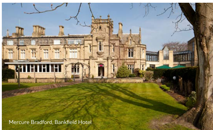
Mercure Bradford, Bankfield Hotel