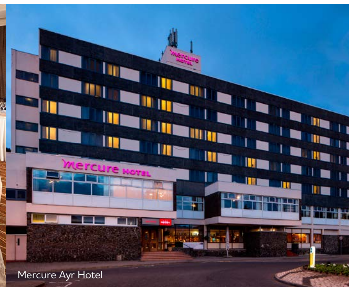
Mercure Ayr Hotel