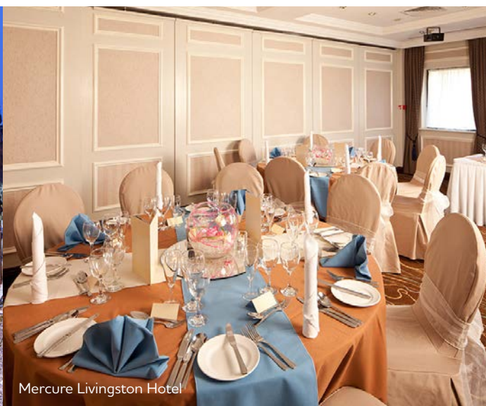
Mercure Livingston Hotel